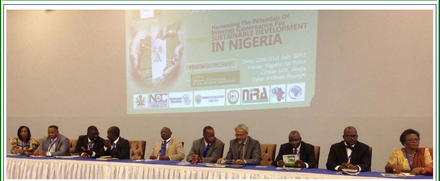
Nigeria Internet Governance Forum (NIGF) 2015 with the theme: "Harnessing the Potentials of Internet Governance for Sustainable Development in Nigeria" was held on Monday 20th and Tuesday 21st July 2015 at Nigerian Air Force (NAF) Center, Abuja.